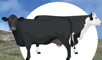
Igenity Commercial Females