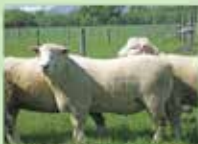
High Survival, High Performance Runnys