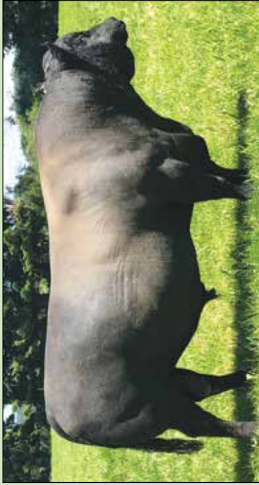
MEADOWSLEA F540 – now 13 years old. Outstanding maternal and fertility traits. He ranks in the top 10% of the breed for calving ease, short gestation, low birth weight, short days to calving, milk and rib fat, as well as IMF%. He features in the pedigrees of a big percentage of the bulls on offer. SEMEN AVAILABLE

This is a real endorsement of the emphasis we place on fertility and maternal traits in our breeding programme.