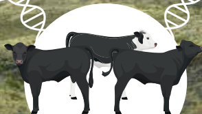
Greater genetic gain & profit