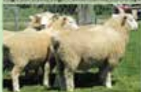
1/2 Romney x 1/2 Perendale (Brendale) 1/2 Romney x 1/4 Perendale x 1/4 Texel