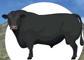
Stud Bull EBV's