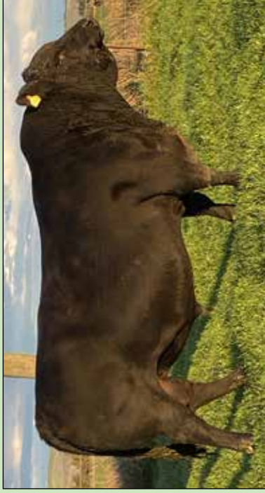
MEADOWSLEA MEAT MACHINE G914 - now 12 years old and exceptionally well-muscled. He is a breed trait leader for calving ease and ranks in the top 5% of the breed for low birth weight. Exceptional easy doing attributes with rib and rump fats in the top 1% for the breed. His easy calving traits have been inherited by many of the bulls in this catalogue.