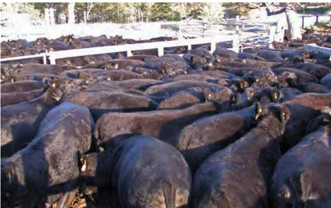
Meadowslea stud 18mth in calf heifers showing good fat coverings and ready to winter on the hill.

A cow's condition and her ability to lay down fat in times of surplus is a very important trait. Any Angus cow should do this under easy down-country conditions, but to be able to do this on native hill country blocks is a very desirable trait. This rib and rump fat is the cheapest and most efficient energy store on the farm and will determine the fertility of the herd after a hard winter or difficult spring conditions to get cows back in calf.