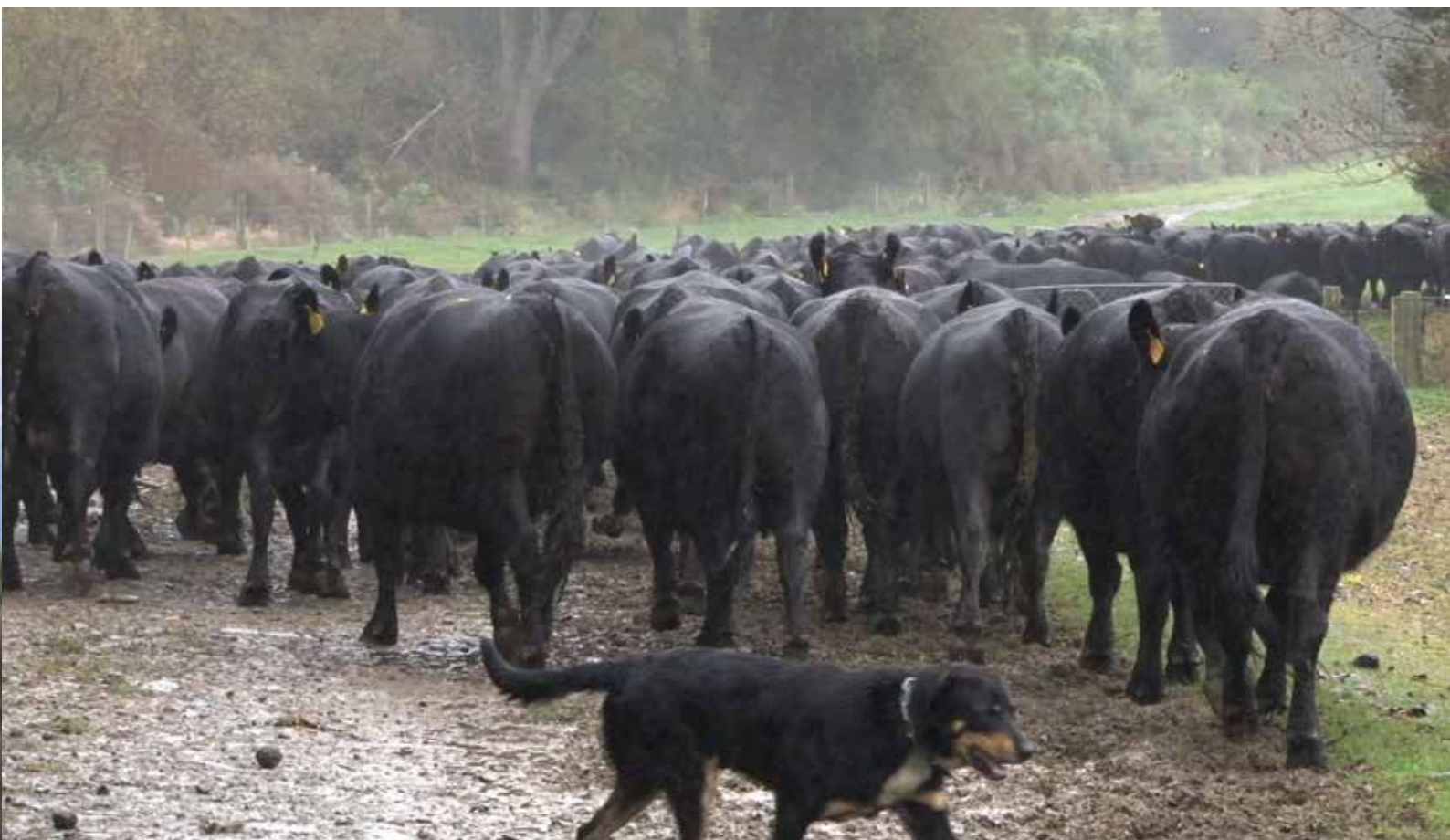
Meadowslea Stud cows after weaning - job done for another year!