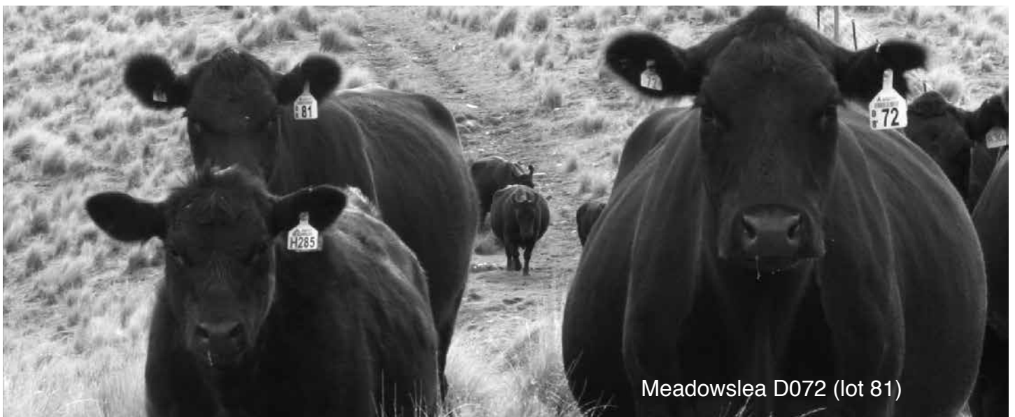
Meadowslea D072 (lot 81)