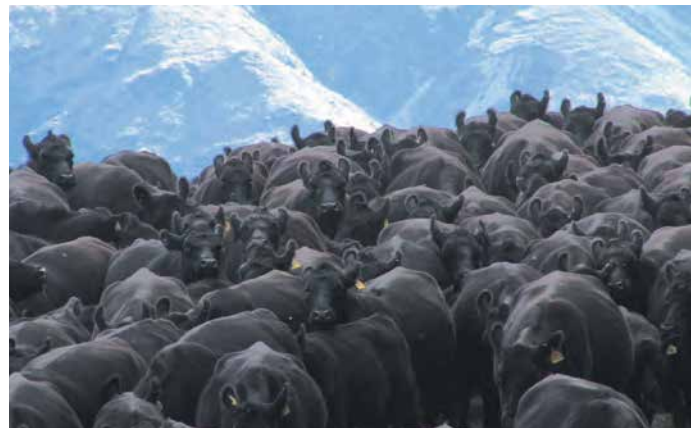
Meadowslea cows and calves come down off the hill for weaning.

A cow's condition and her ability to lay down fat in times of surplus is a very important trait. Any Angus cow should do this under easy down-country conditions, but to be able to do this on native hill country blocks is a very desirable trait. This rib and rump fat is the cheapest and most efficient energy store on the farm and will determine the fertility of the herd after a hard winter or difficult spring conditions to get cows back in calf.