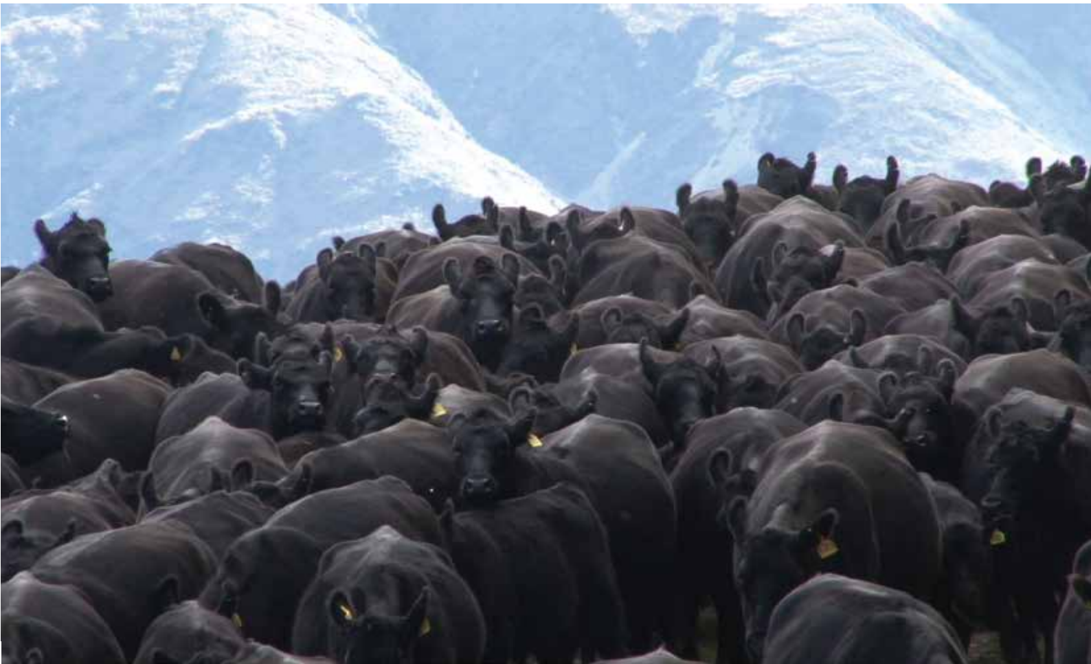
Meadowslea Stud cows and calves come off the hill for weaning