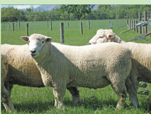
High Survival, High Performance Romneys