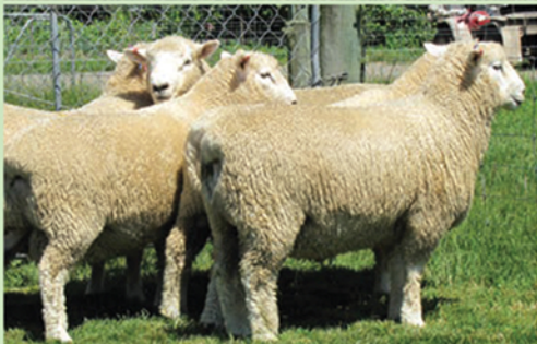
1/2 Romney x 1/2 Perendale (Romdale) 1/2 Romney x 1/4 Perendale x 1/4 Texel