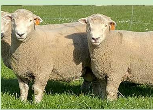
High Survival, High Performance Romneys Plus new Worm resistant line!