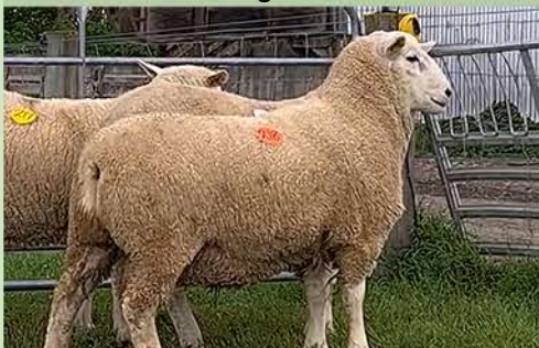
K Maternal hill-bred composite