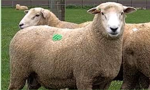
1/2 Romney X 1/2 Texel 3/4 Romney X 1/4 Texel