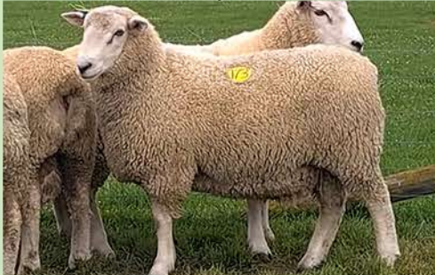
K X Romney (1/2 composite x 1/2 Romney)