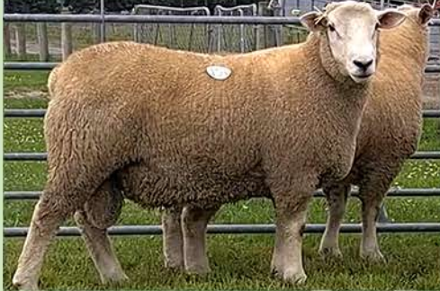
1/2 Perendale x 1/2 Romney (Romdale) 1/4 Perendale x 1/4 Texel x 1/2 Romney