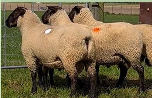
Terminator tough hill-bred sire