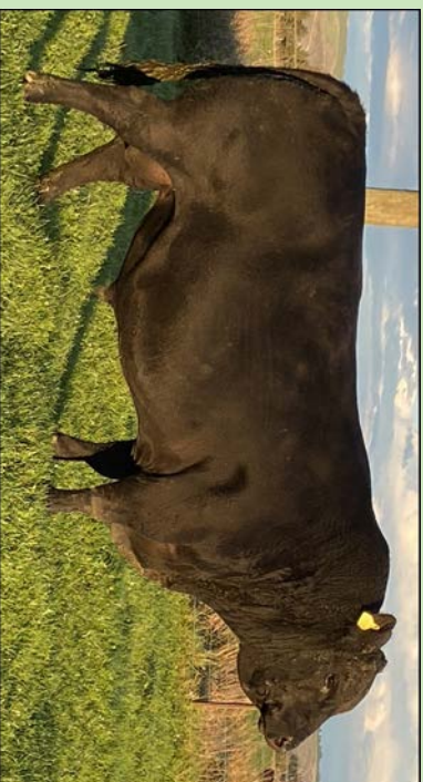
MEADOWSLEA MEAT MACHINE G914 - deep, thick, and exceptionally well muscled. He is a trait leader for calving ease, and ranks in the top 5% of the breed for short gestation, the top 10% for low birth weight, and the top 1% for both rib and rump fat. SEMEN AVAILABLE