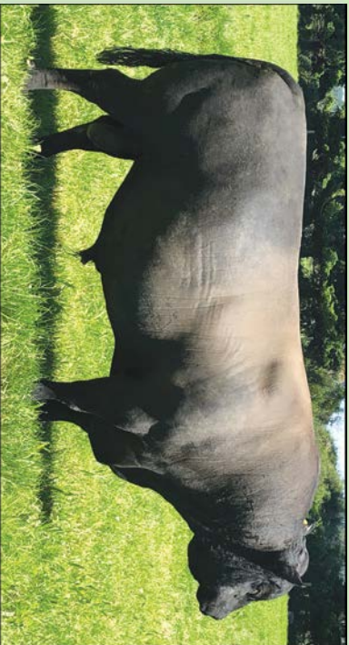
MEADOWSLEA F540 - 11 years old and still going strong. Outstanding maternal and fertility traits; ranks in the top 15% of the breed for calving ease, and the top 10% for scrotal size, rib fat and rump fat. His short gestation, milk, and short days to calving figures are in the top 1%! SEMEN AVAILABLE

These two senior sires, now aged 11 and 10 years, have had a profound impact on the Meadowslea stud and the bulls in this catalogue, with a large selection ideally suited to heifer and dairy cow mating. This is a real endorsement of the emphasis we place on fertility and maternal traits in our breeding programme.